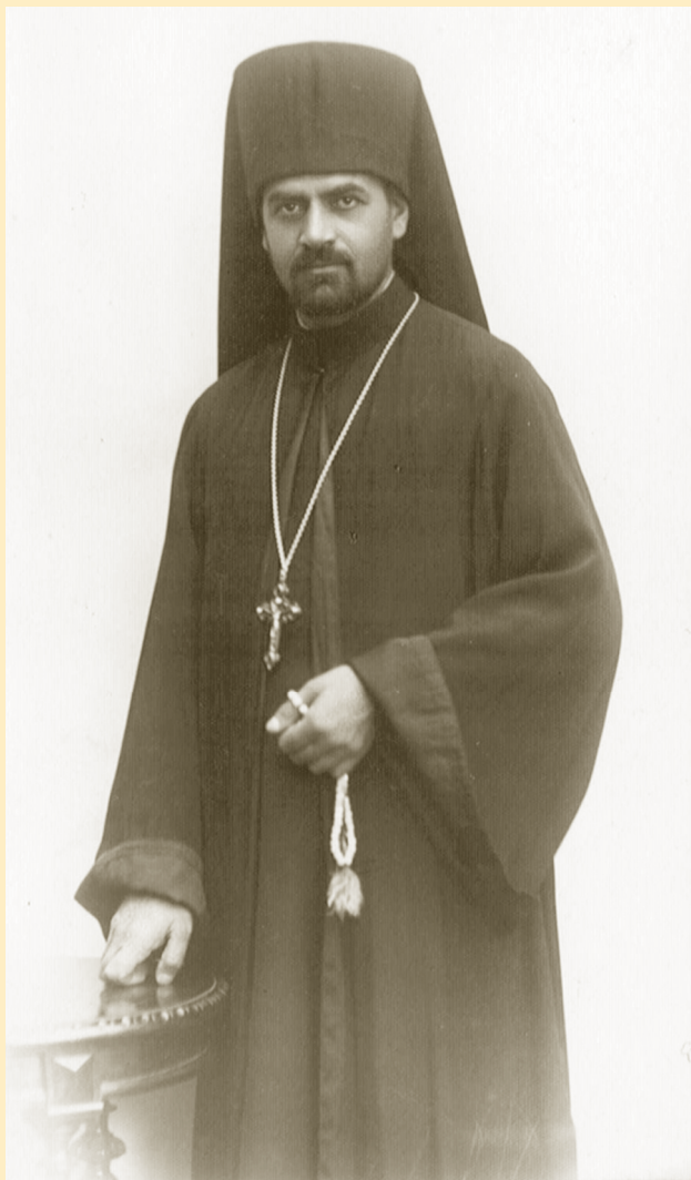
ST. GRIGOL (PERADZE) PROFESSOR OF THE UNIVERSITY OF WARSAW (1933-1942)