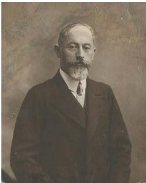
Noe Zhordania (1868-1953) Prime Minister of Georgia (1918-1921) Emigré in France (1921-1953)