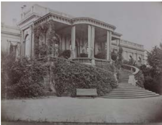
Viceregent Palace in Tbilisi, White Hall, seat of the Transcaucasian Sejm, 1918

The Sejm remained the main legislative body of the Republic. Its prime-minister became Georgian politician Akaki Chkhenkeli. On May 26, 1918 the Sejm announced the corrosion of the Republic and its self-dissolution. As a result three Transcaucasian countries proclaimed their independence: Democratic Republic of Georgia (May 26, 1918), Democratic Republic of Armenia (May 28, 1918) and Democratic Republic of Azerbaijan (May 28, 1918).